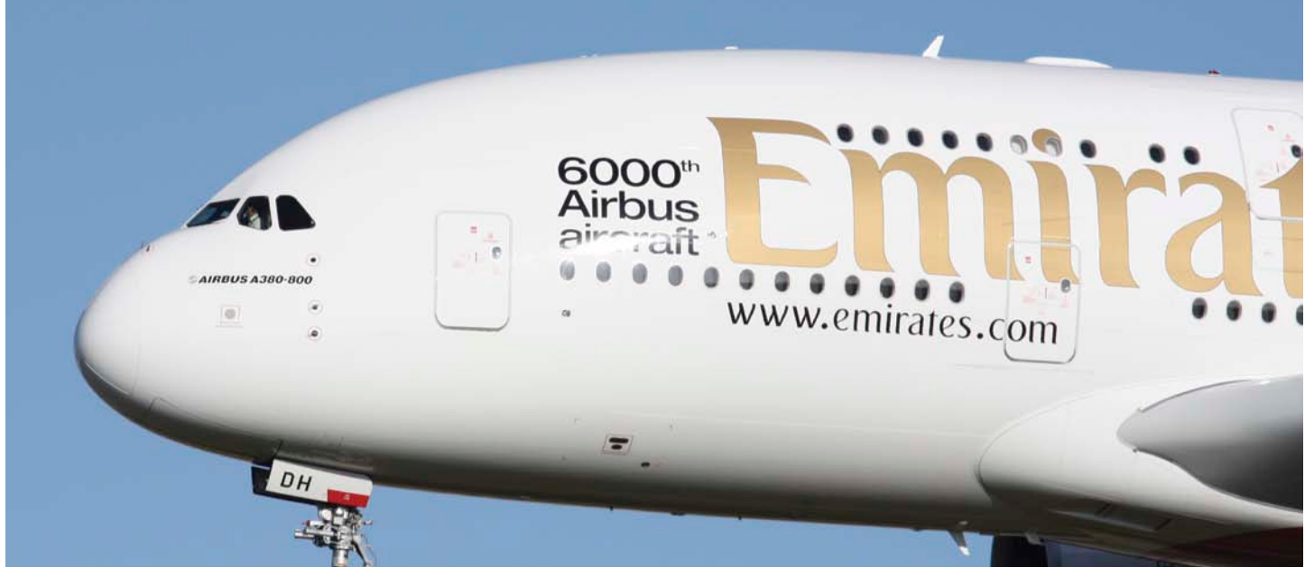
Aviox coatings system takes flight on 6000th Airbus aaircraft